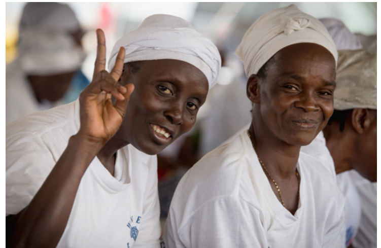
A woman in Liberia flashes the peace sign. The Carter Center has worked to help establish rule-of-law and mental health infrastructure in the country following two civil wars.

Liberia endured two civil wars in the 1990s, and the Center helped bring about an enduring peace through mediation, then assisted in creating the environment to rebuild. We observed national elections and implemented programs to support access to justice and to information. And we are assisting the country as it builds a mental health care system from the ground up, crucial in any country but especially one where the wounds of war are still fresh.