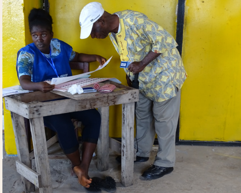
In a photo from a previous election, a Liberian man checks in at a polling station to vote. Under a grant from Sweden, The Carter Center is working with the Liberia Election Observation Network to further citizen monitoring of democratic processes.

An umbrella organization with national coverage and a presence in each of Liberia's 73 electoral districts, LEON has observed electoral and democratic processes since 2017, emerging as a recognized and respected voice on election-related issues in Liberia. The organization has built a reputation for increasing government transparency, encouraging citizen engagement, building confidence in the Liberian government, and supporting peaceful elections. LEON's